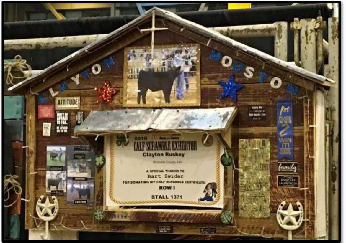
Note: Good HLSR Stall Sign Placement